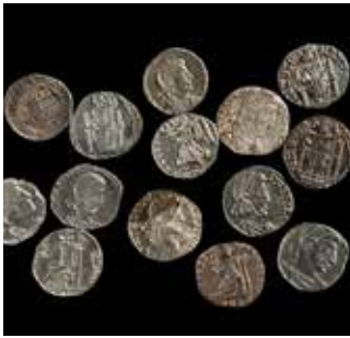
Picture acquired under the Treasure Act 1996

We have a legal duty to report Treasure finds in Wales. This means things or places that are found by the public that are important and valuable.